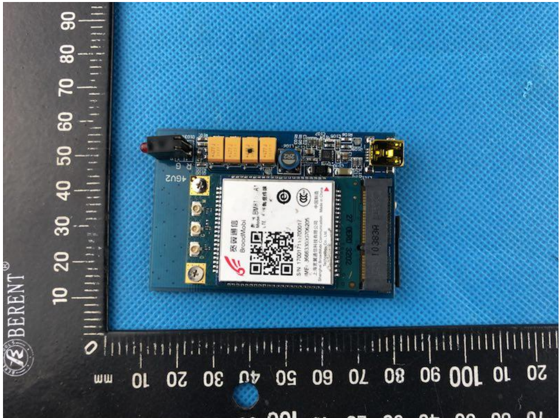
EUT on the test jig Photos(front)