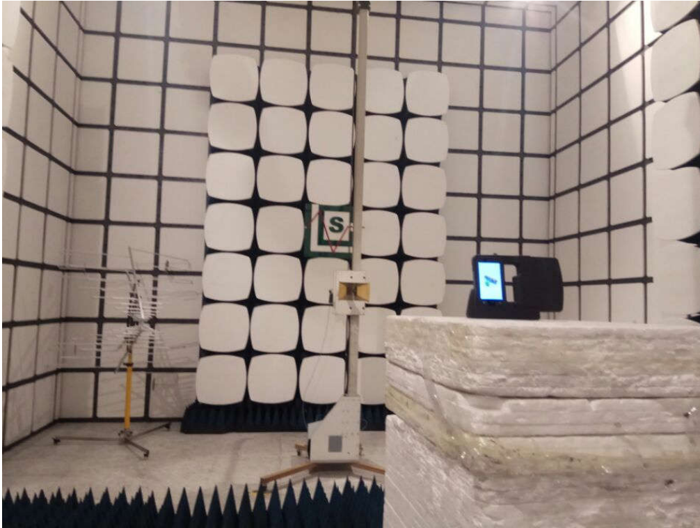
Spurious Emission above 1GHz