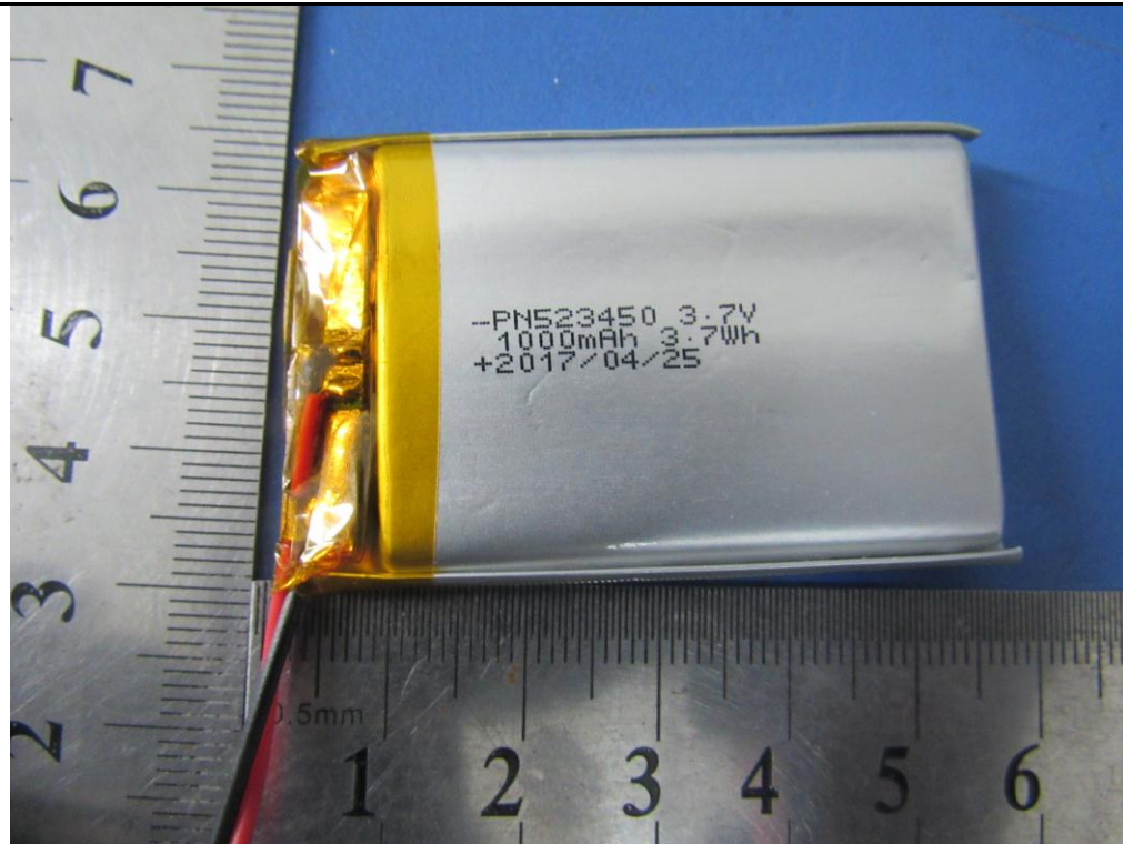
EUT Battery – Front View