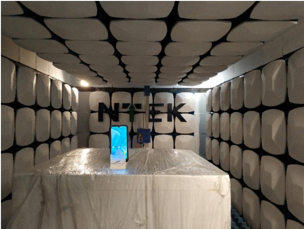
AC Conducted Measurement Photos