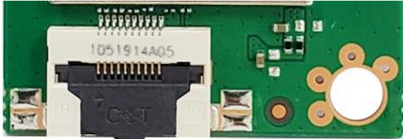
AL-7605B-WG-A and WF-M605B-UWD1

The above-mentioned statements of our company are totally true. If false, we will bear corresponding liability.