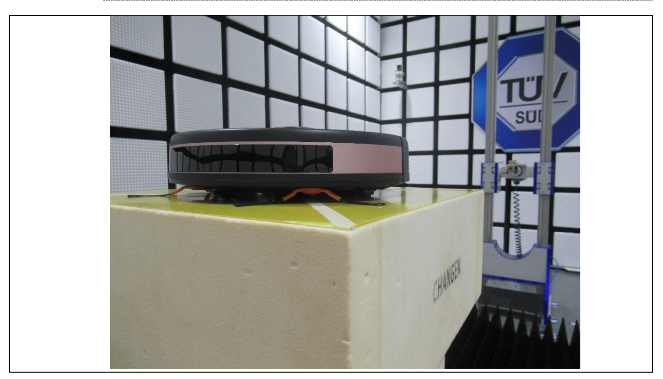
Test setup of: Spurious Radiated Emissions (Above 18 GHz)