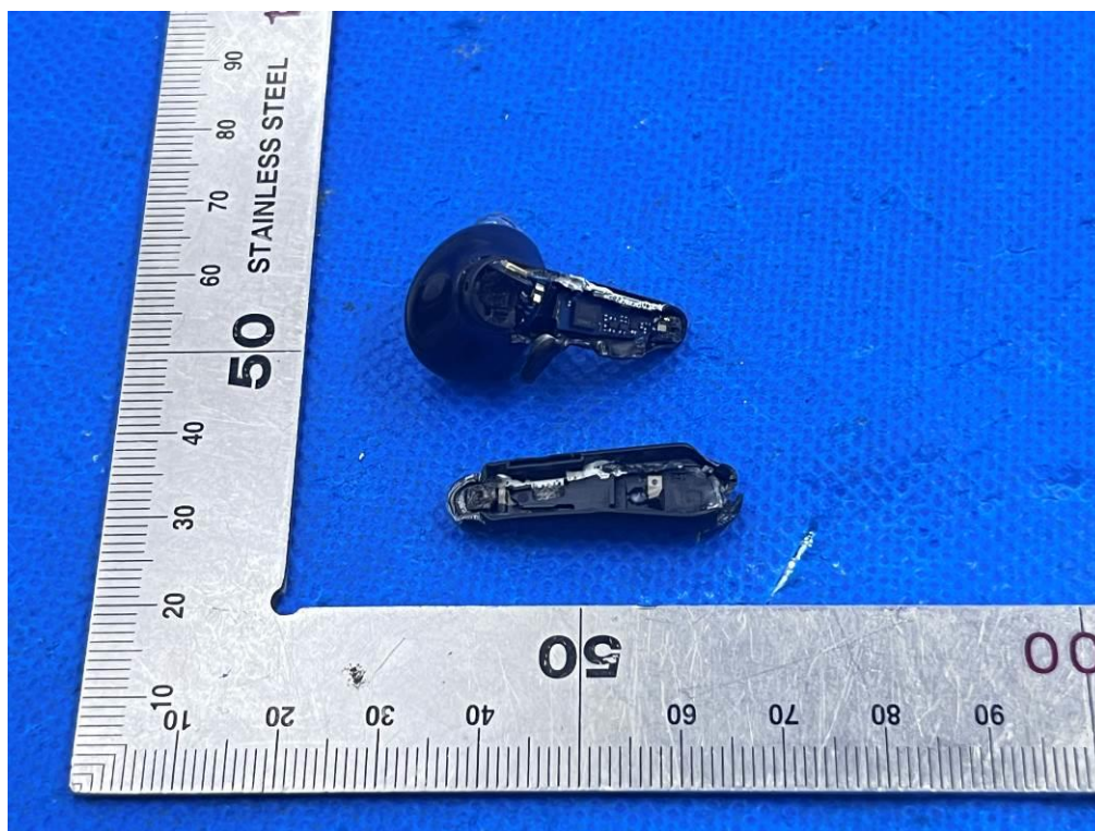
OPEN VIEW OF EUT (FIGURE 2)