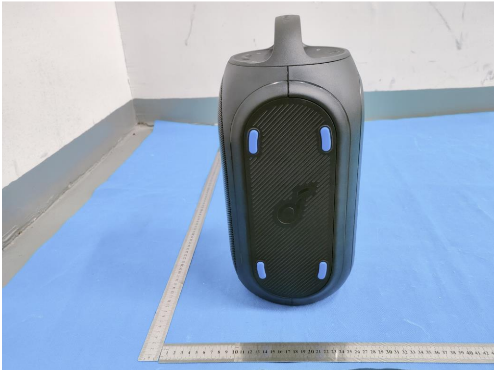
PORT VIEW OF EUT