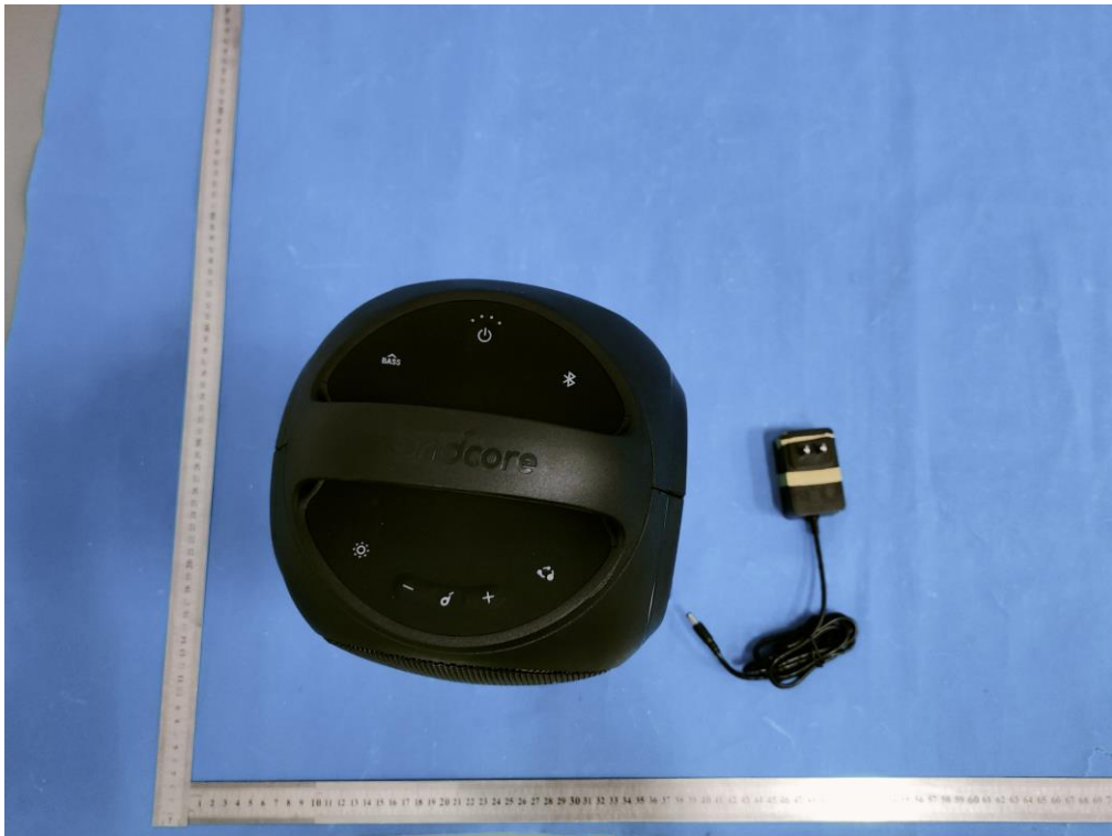
TOP VIEW OF EUT