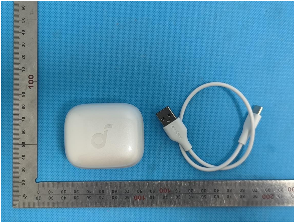
ALL VIEW-4 OF EUT