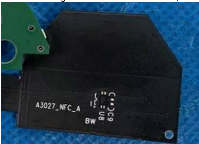
(Old NFC module)

This changes the NFC module, re-testing radiation emissions, Antenna Requirement, Field Strength of Fundamental Emissions, 20dB Bandwidth, Frequency Tolerance