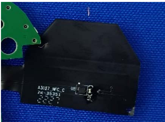
(New NFC module)