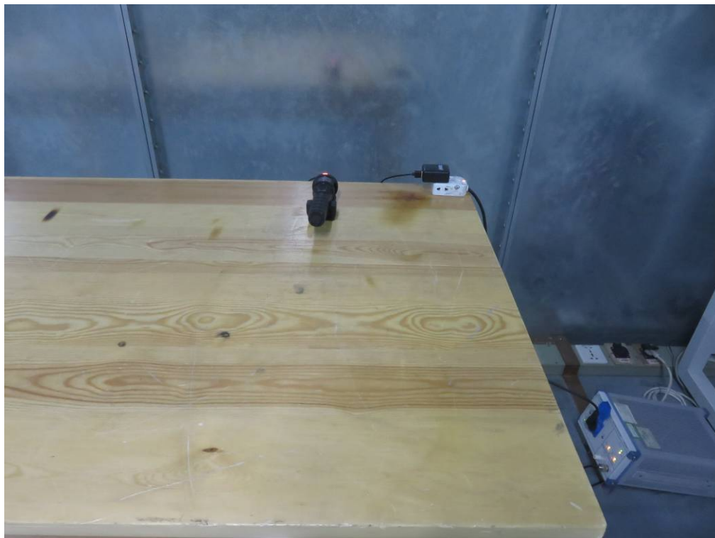
Photo of Power Line Conducted Emissions Measurement