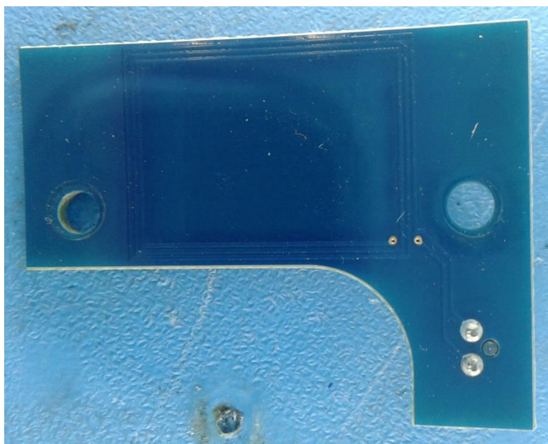
View of bottom side of antenna PCBA