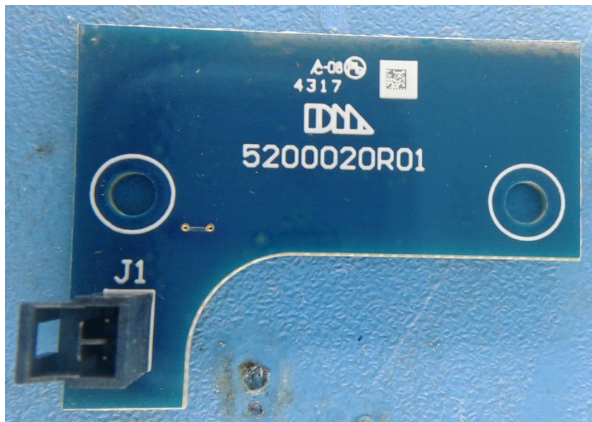
View of top side of antenna PCBA