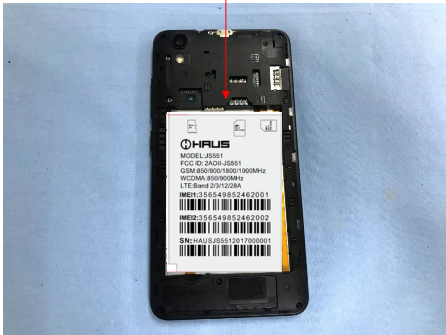
FCC ID Label Location