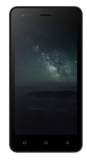
HIRLIS JS551 USER MANUAL