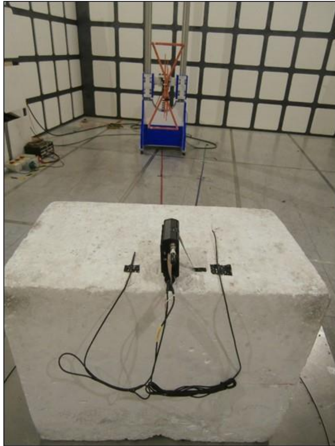
Figure 3 – Radiated Emissions - 30 MHz to 1 GHz, Z Orientation