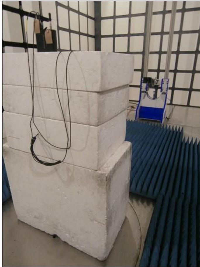
Figure 5 –Radiated Emissions - 1 GHz to 5 GHz, Y Orientation