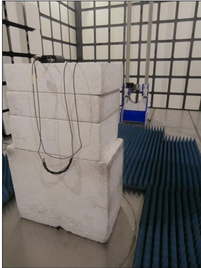
Figure 4 – Radiated Emissions - 1 GHz to 5 GHz, X Orientation