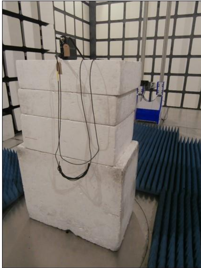
Figure 6 – Radiated Emissions - 1 GHz to 5 GHz, Z Orientation