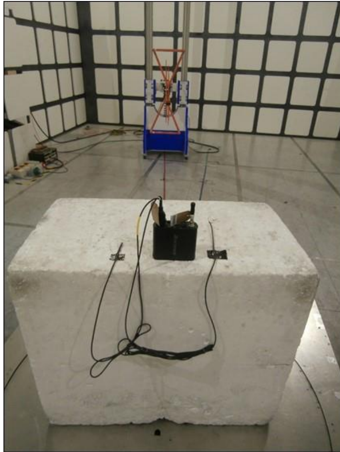
Figure 2 – Radiated Emissions - 30 MHz to 1 GHz, Y Orientation