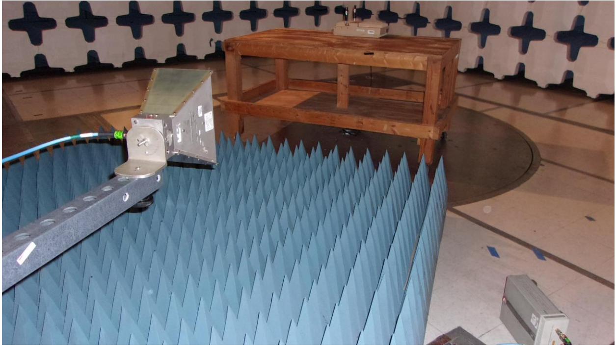
Radiated Measurements 1-10GHz