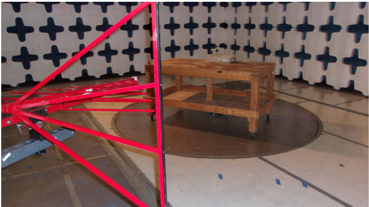
Radiated Measurements 30-1000MHz