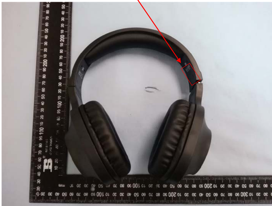
FCC ID Label Location