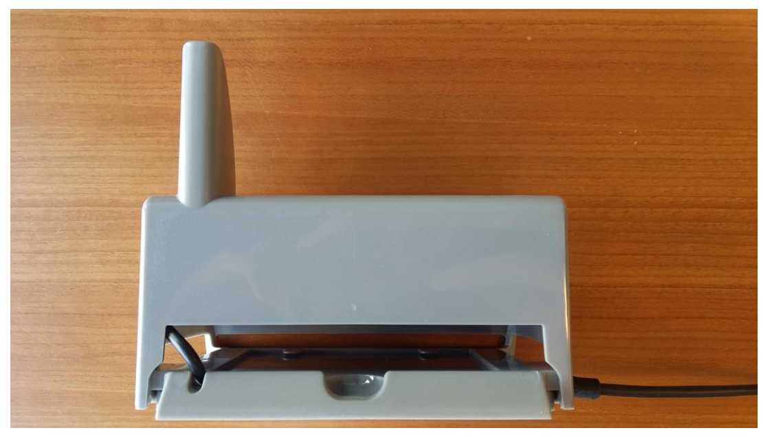
Figure 10: Cockroach configuration seen from the back.