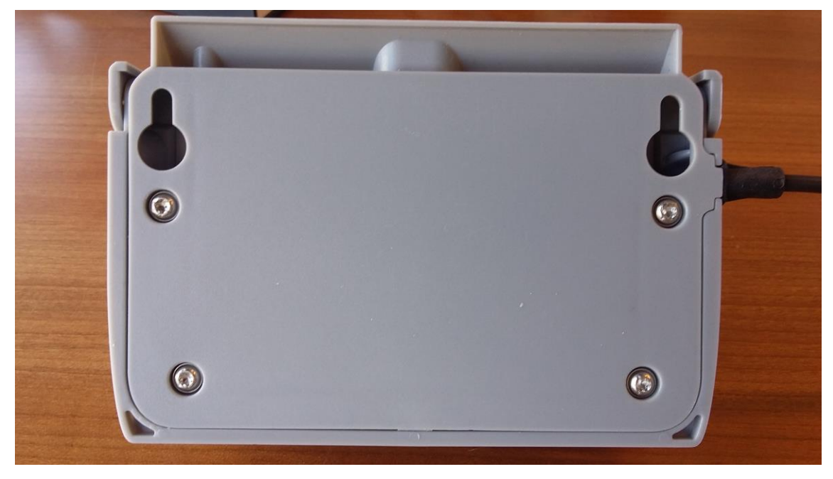
Figure 9: Cockroach configuration seen from the back.