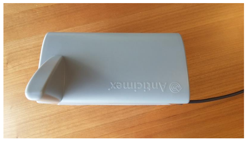
Figure 2: Moth configuration seen from the top