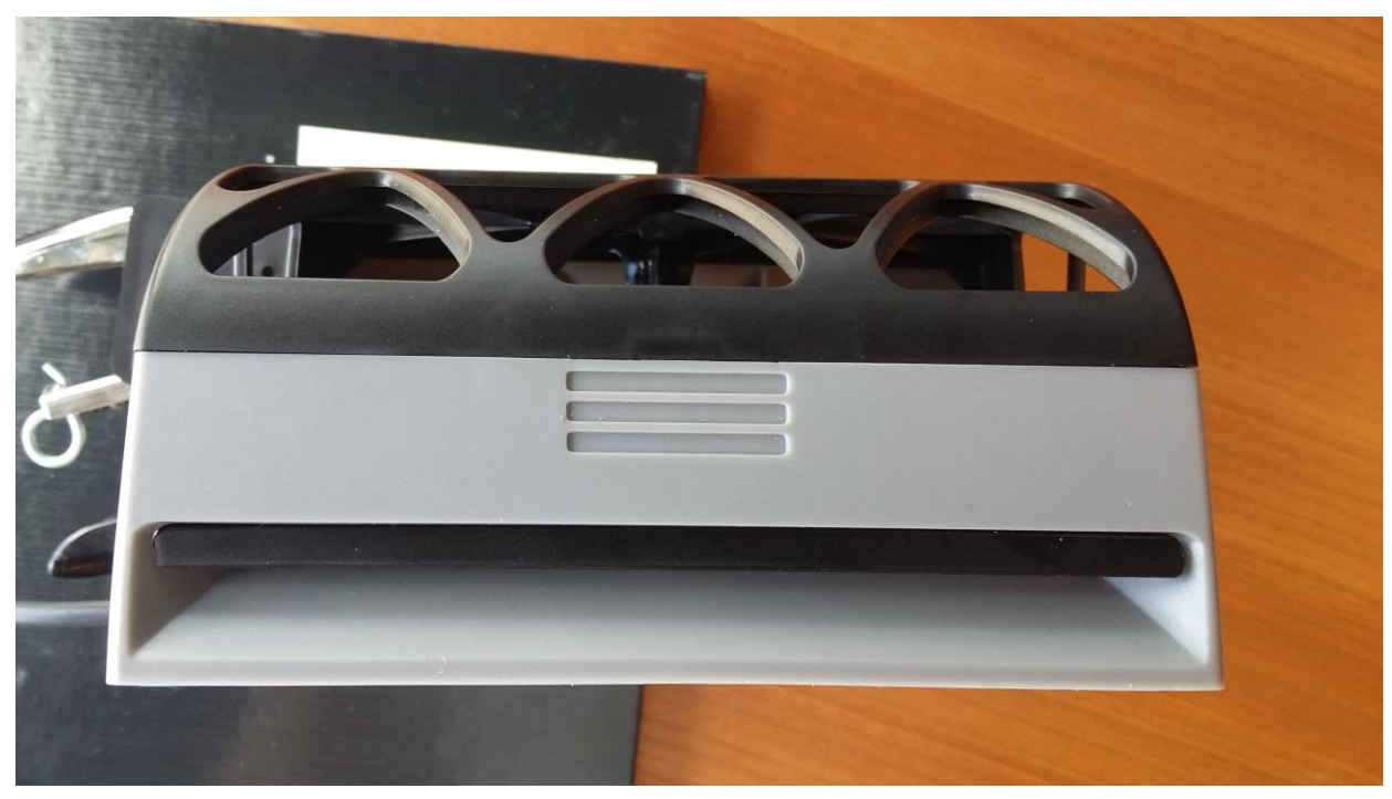
Figure 4: Moth configuration seen from the bottom.