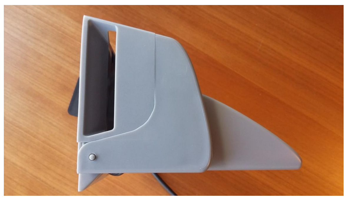
Figure 8: Cockroach configuration seen from the side.