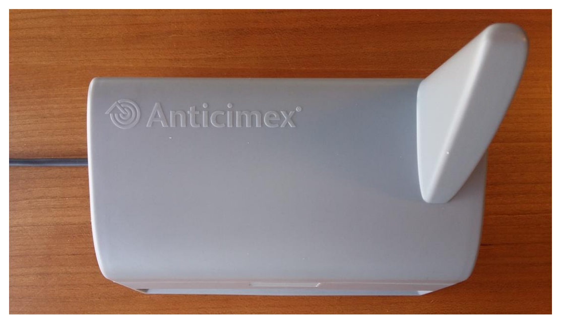
Figure 12: Cockroach configuration seen from the top.