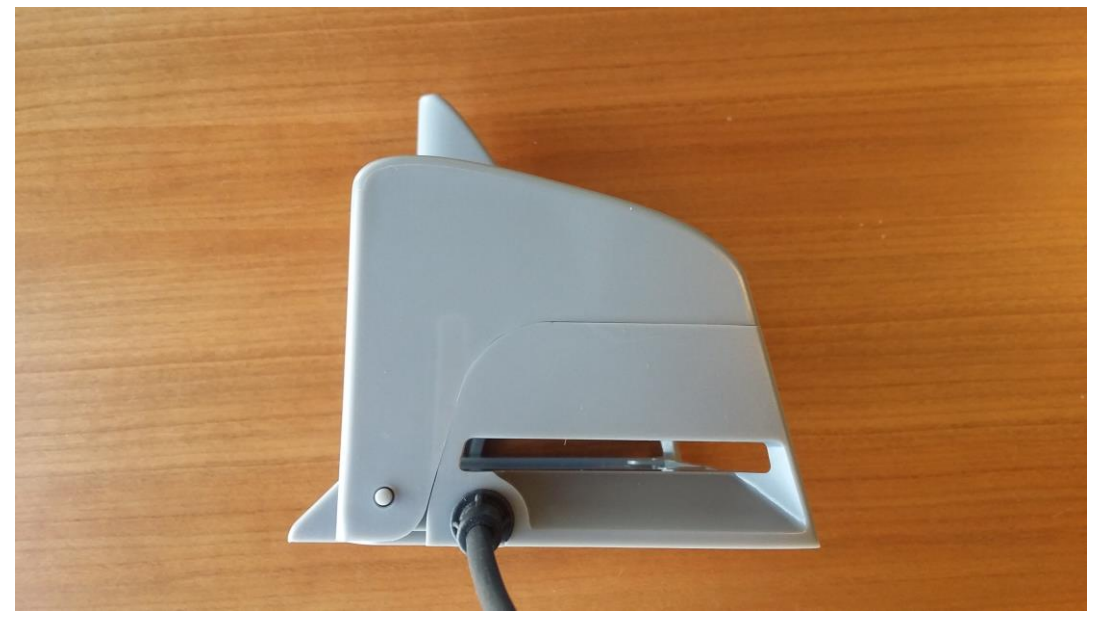
Figure 11: Cockroach configuration seen from the side.