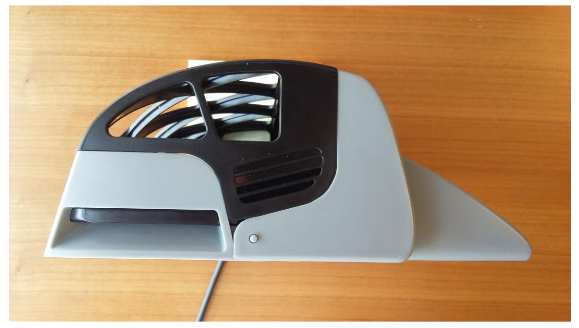
Figure 6: Moth configuration seen from the side.