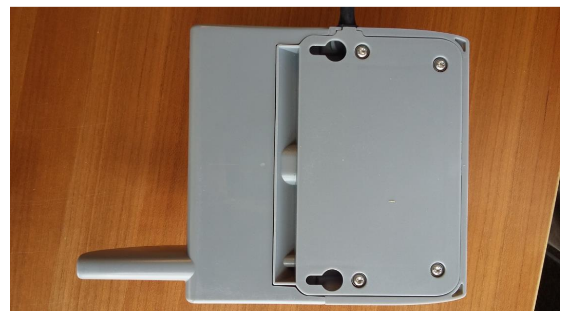
Figure 3: Moth configuration seen from behind.