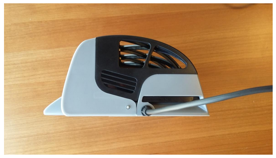
Figure 5: Moth configuration seen from the side.