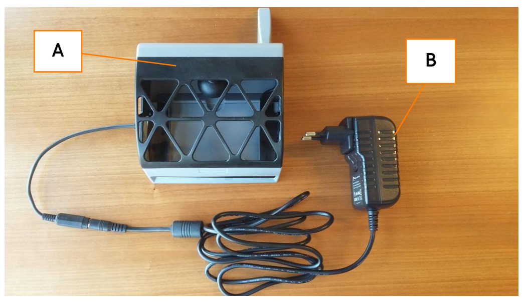
Figure 1: A) Moth configuration seen from the front. B) External power supply.