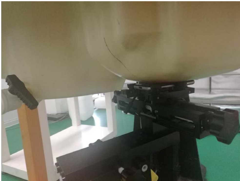
Picture - 2 Left Hand Touch Cheek Position