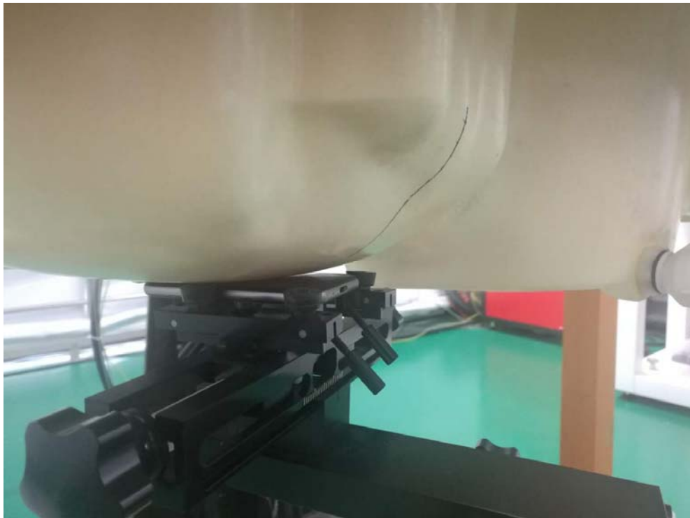
Picture - 4 Right Hand Touch Cheek Position