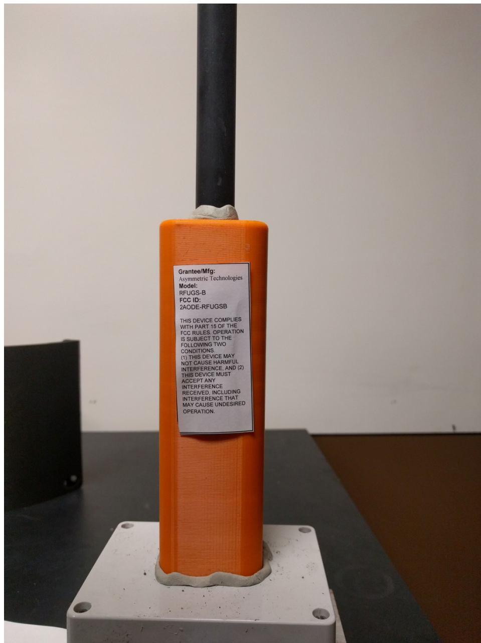
Figure 1. Label location

FCC Part 15 Certification 2AODE-RFUGSB 17-0454 March 5, 2018 Asymmetric Technologies RFUGS Model B