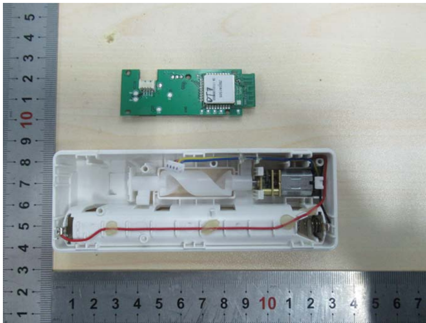
EUT – PCB Top View