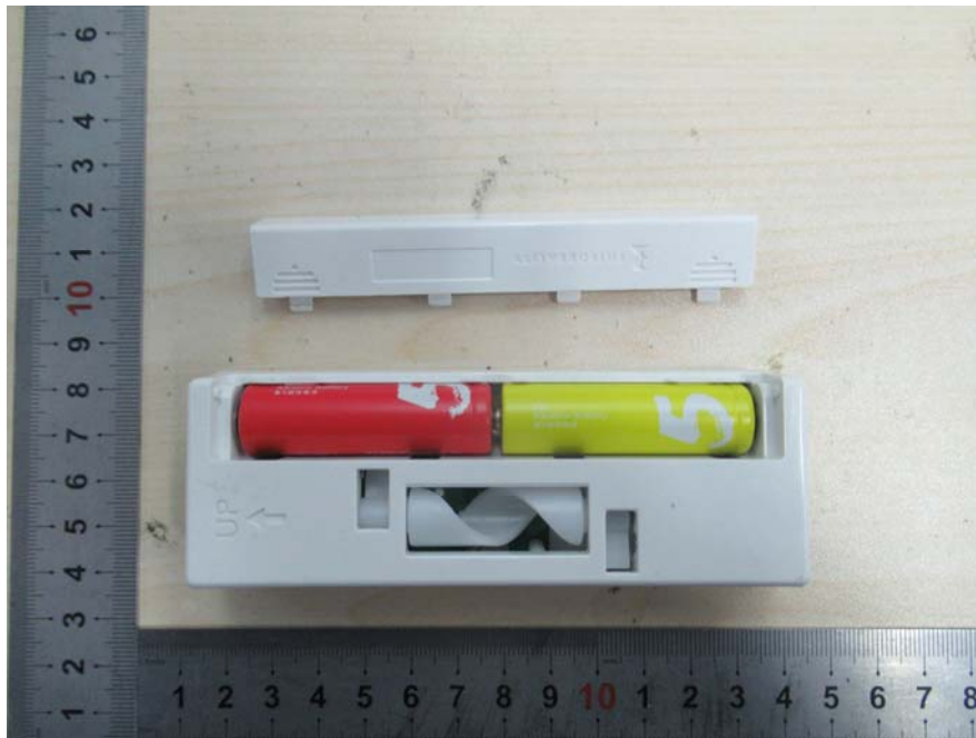
EUT – Cover off View-2