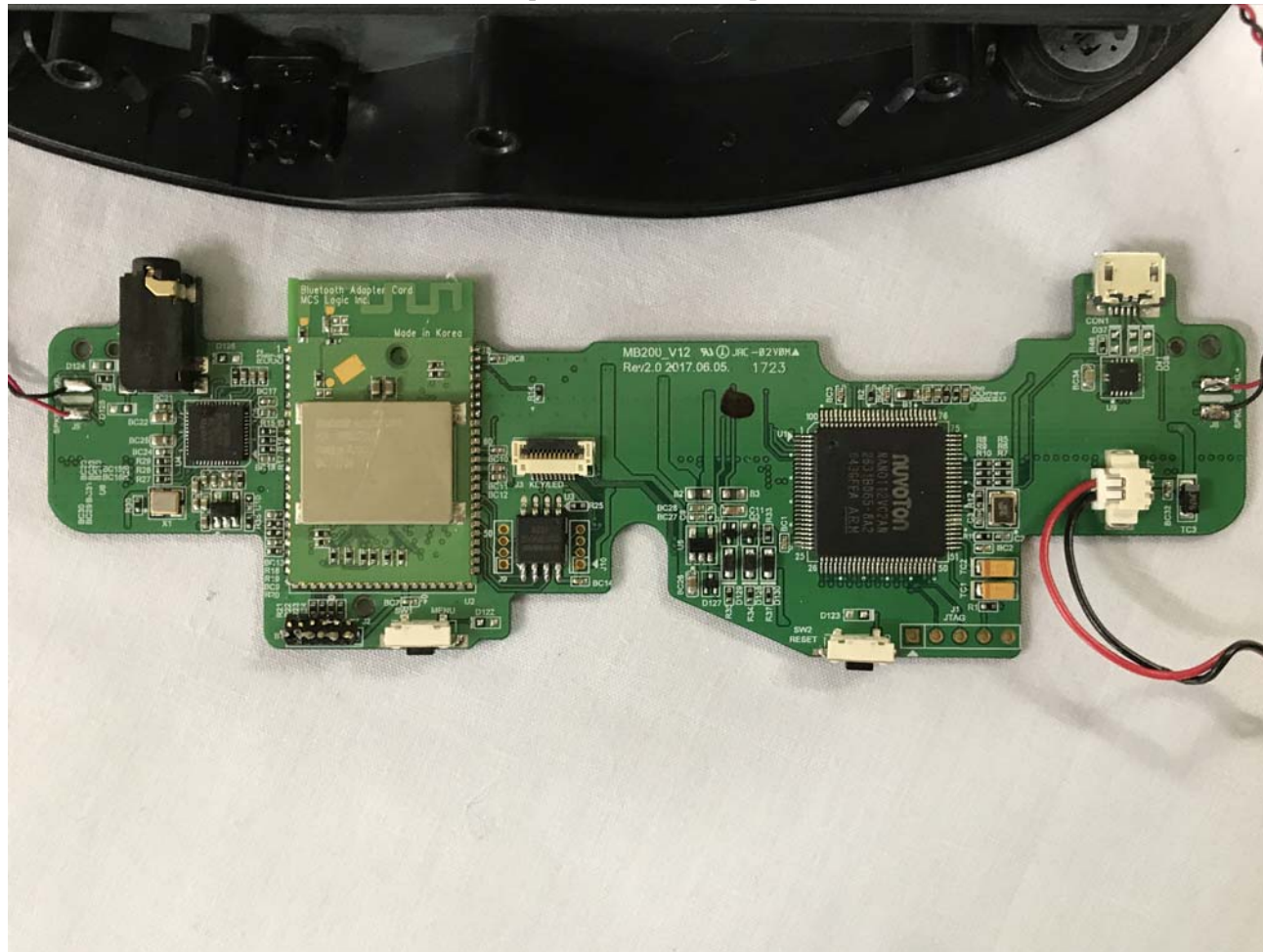
[Main board Front]