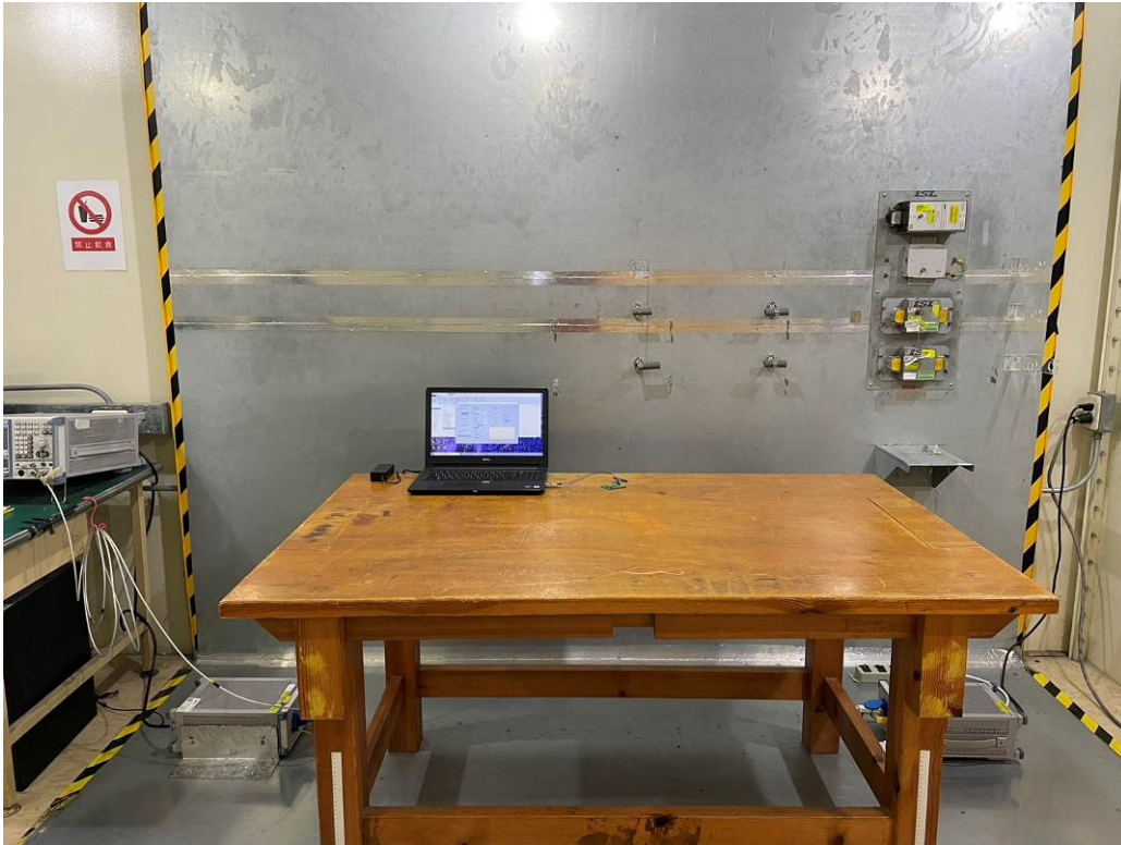
Conducted Emission Set up Photo