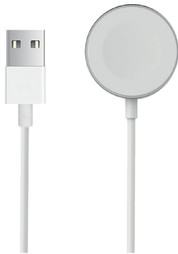
Apple Watch Charging cable