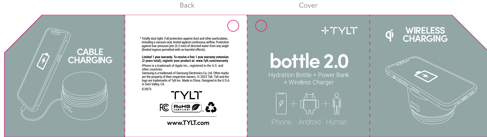
Outside Spread Open