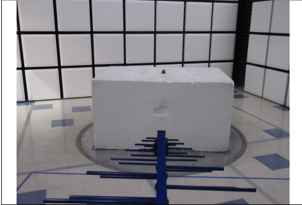
RF Radiated #2