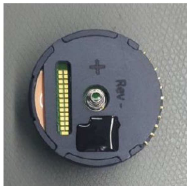
Figure 1 Circuit Boards Permanently Set in Encapsulant

These documents contain trade secrets, detailed system and equipment descriptions about the product and its custom design, which we consider proprietary and confidential information and otherwise, would not release to the public. The device is encapsulated and the internal components and circuit boards are not accessible or visible to the customer. The internal components and circuit boards are permanently set in place by encapsulating material, as shown in Figure 1, and the only manner to access them is to damage the product and the internal circuit boards. We maintain that the disclosure of this information would be of unfair benefit to competitors and cause us substantial competitive harm.