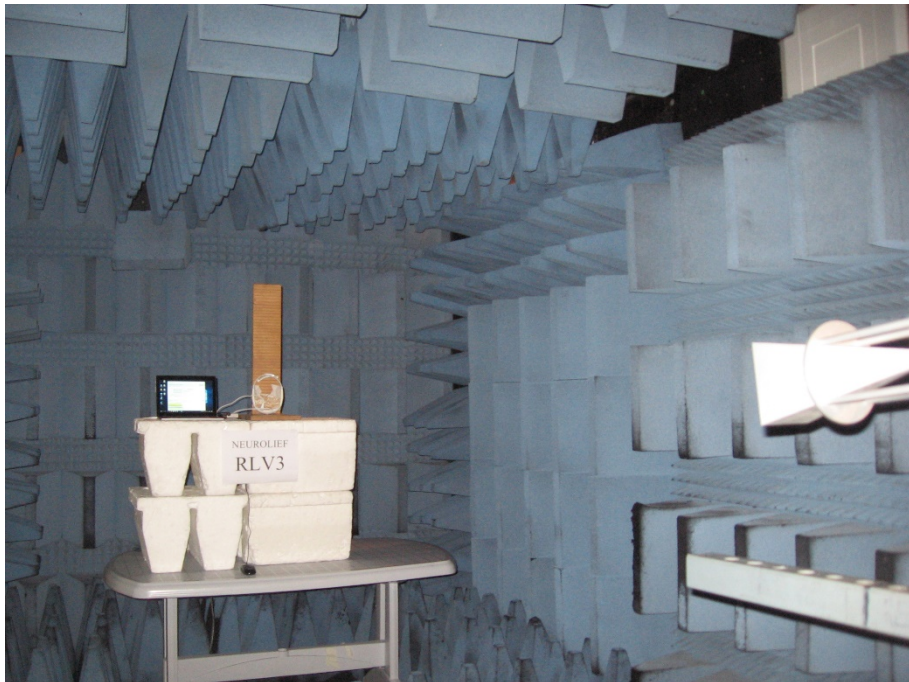
Radiated Emission Test, 18-26.5GHz