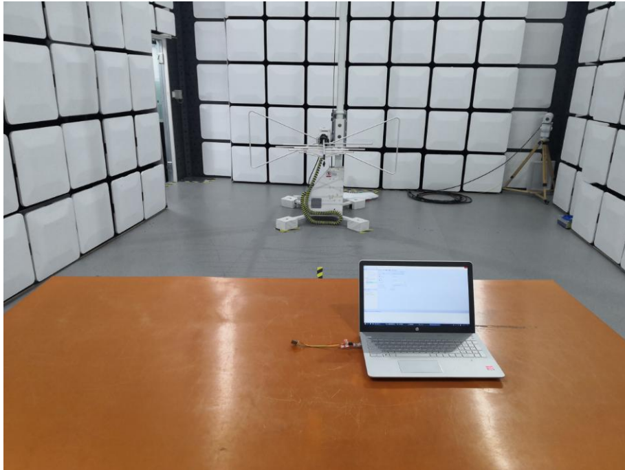
Radiated Measurement (Above 1GHz)