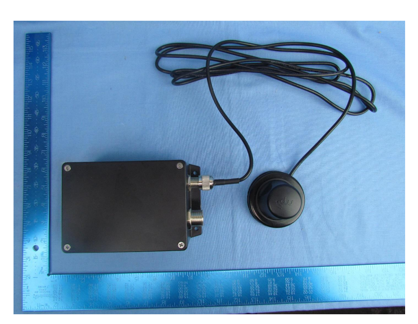
DV31DC - Top View

This test report may be reproduced in full only. The document may only be updated by MiCOM Labs personnel. All changes will be noted in the Document History section of the report.