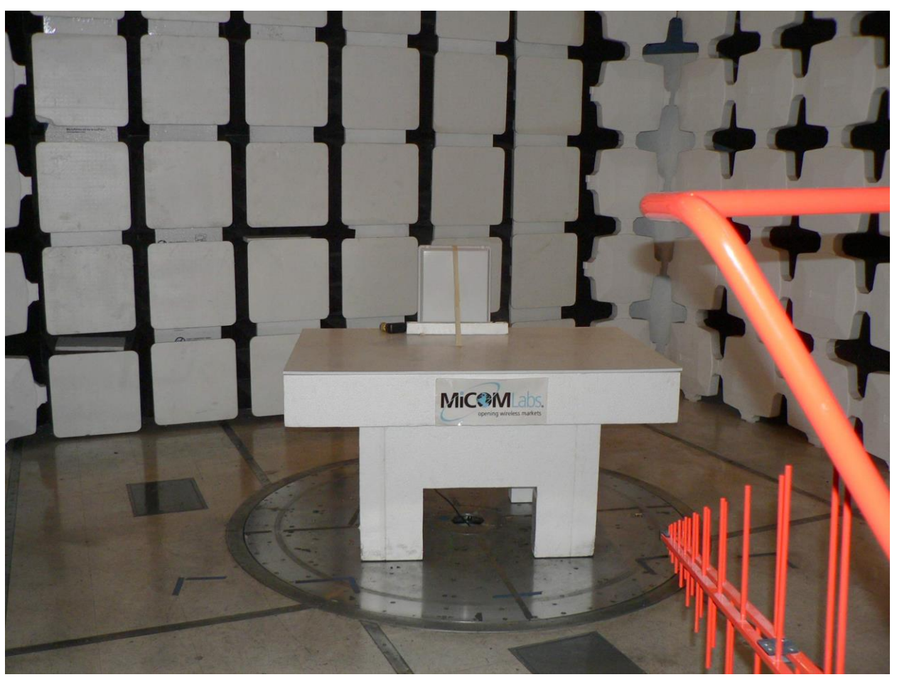
DVD21POE Digital Emissions 30-1000 MHz