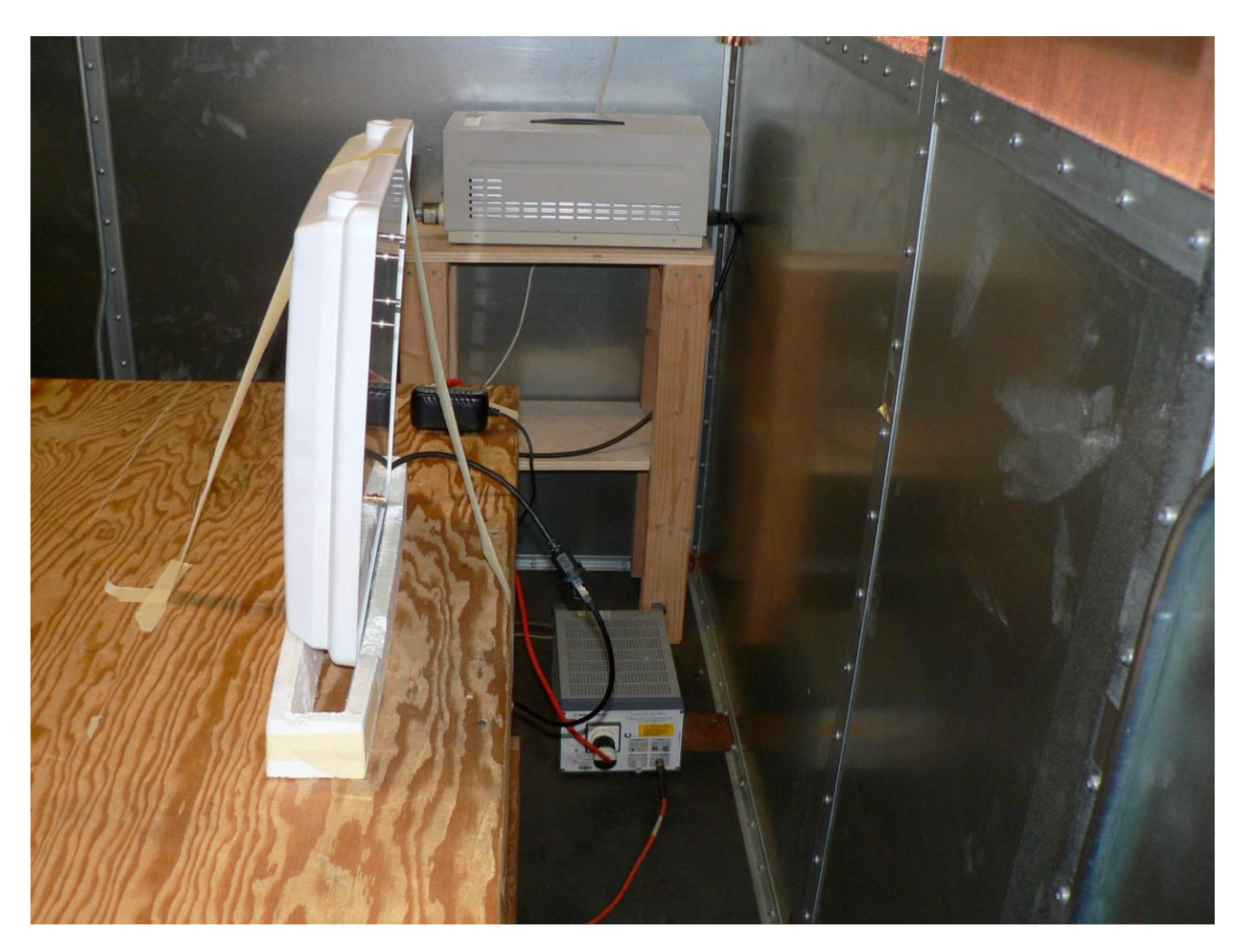
DVD21POE AC Mains Side