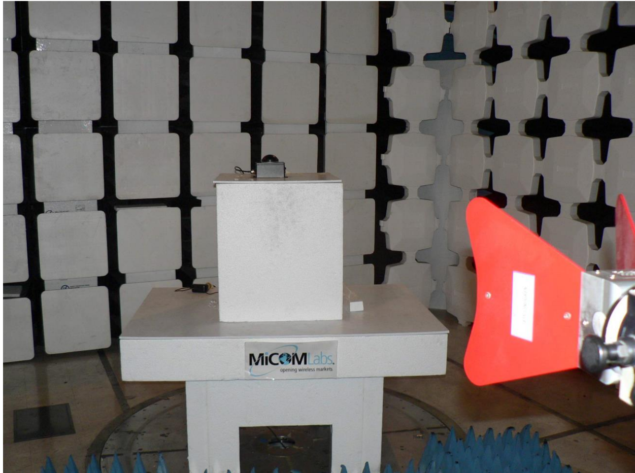
DVD41POE TX Spurious 1-18 GHz