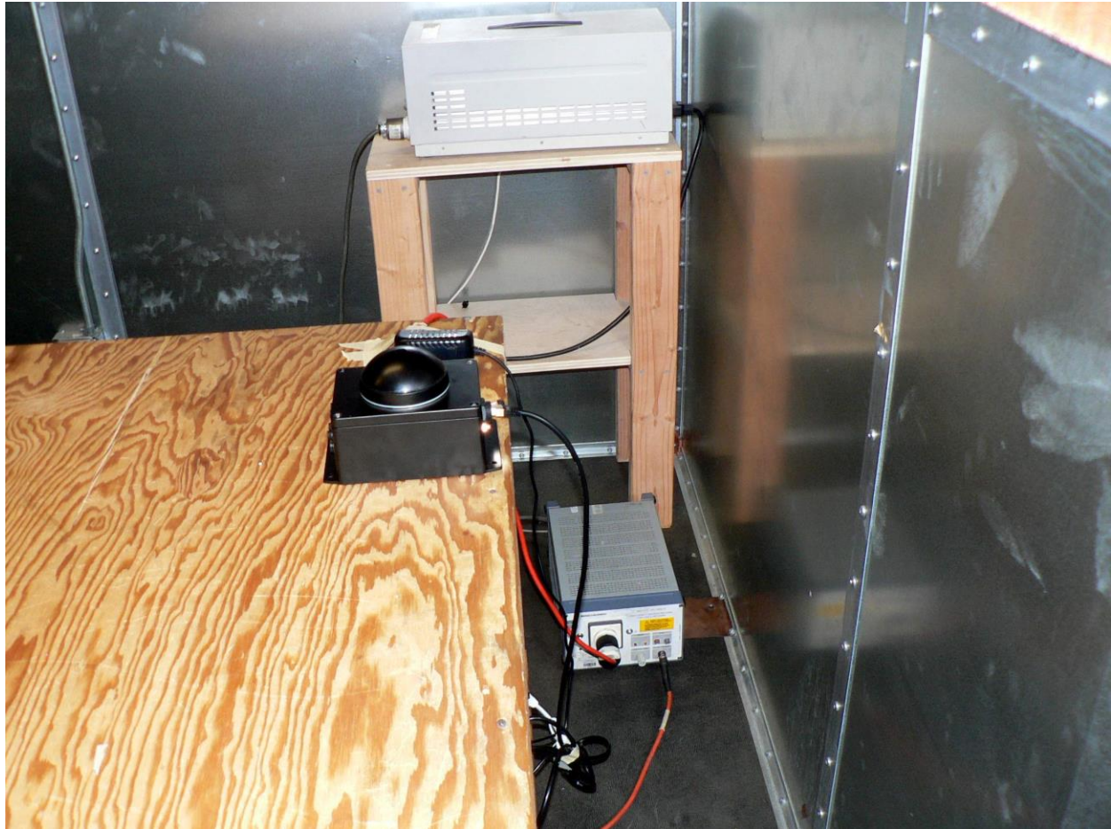
DVD41POE AC Mains Side

This test report may be reproduced in full only. The document may only be updated by MiCOM Labs personnel. All changes will be noted in the Document History section of the report.