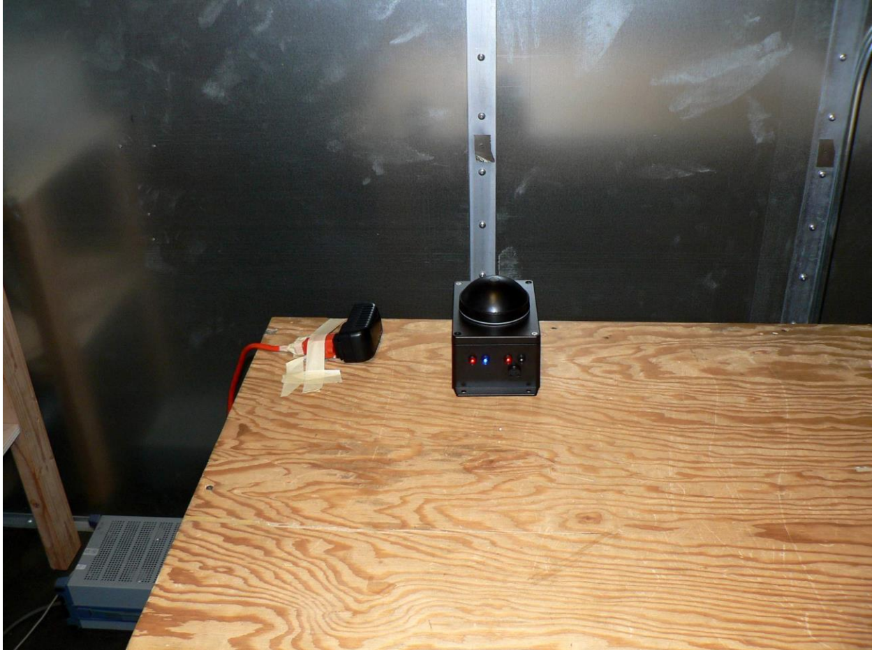
DVD41POE AC Mains Front

This test report may be reproduced in full only. The document may only be updated by MiCOM Labs personnel. All changes will be noted in the Document History section of the report.