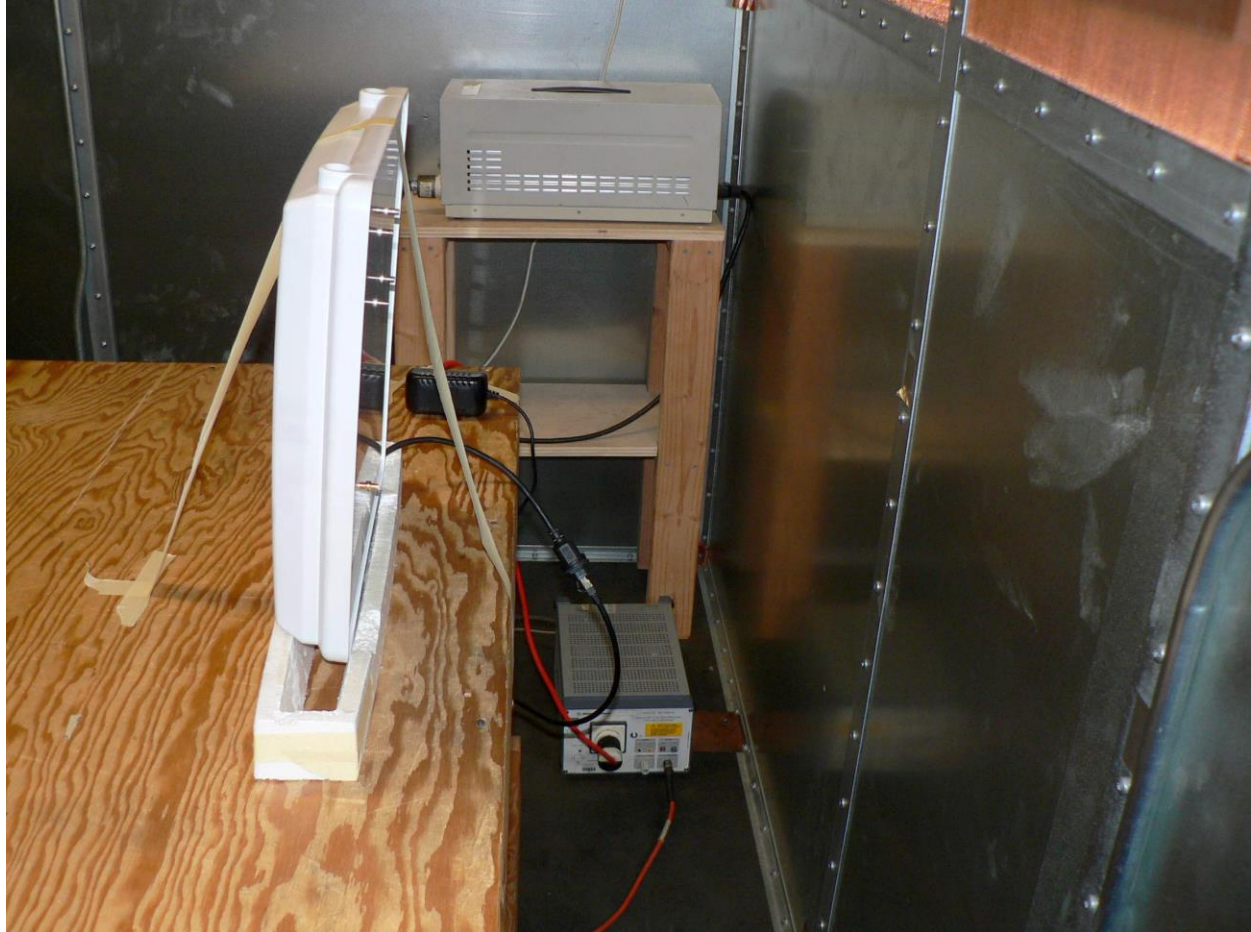
DVD21POE AC Mains Side