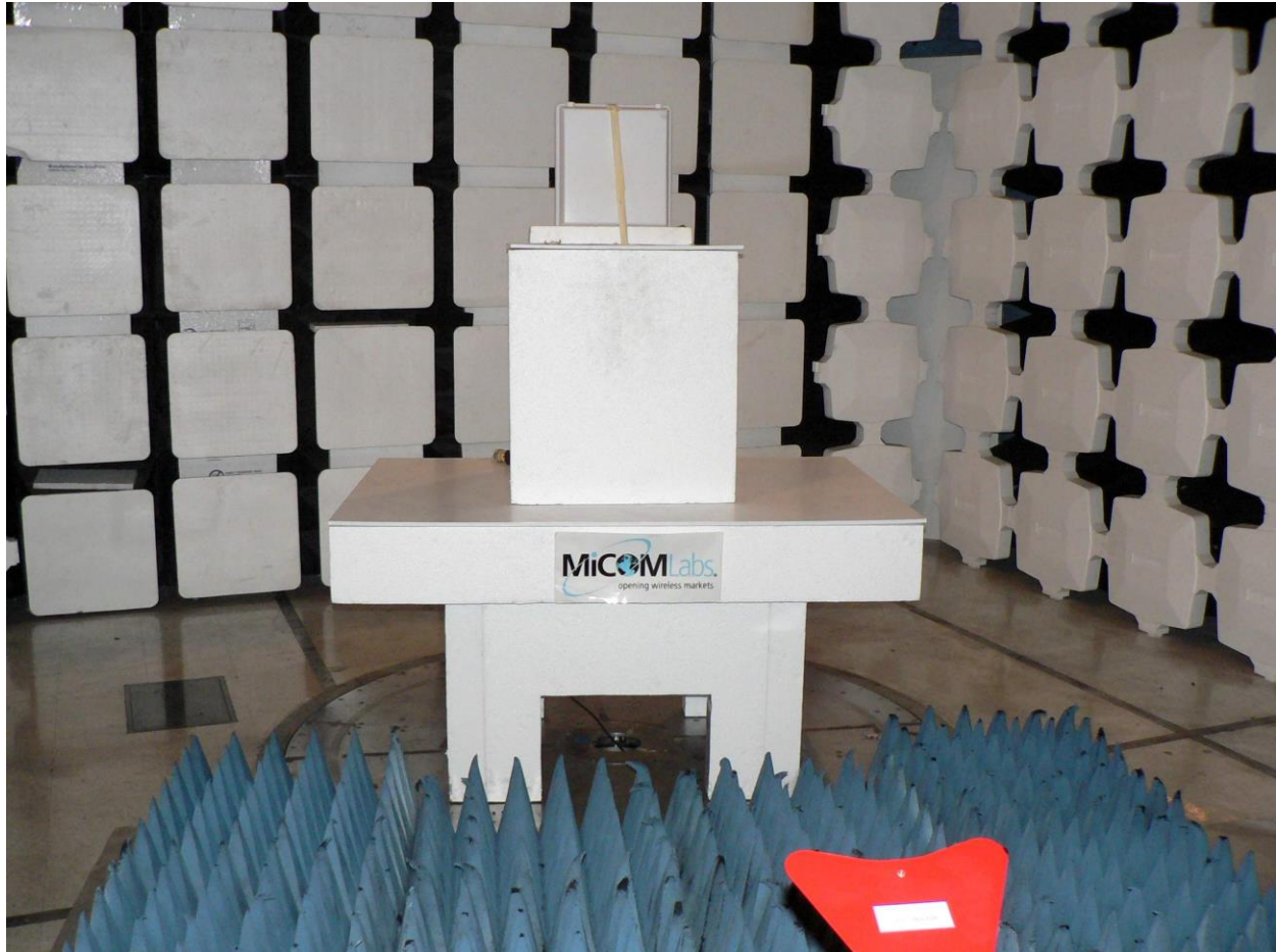
DVD21POE TX Spurious 1-18 GHz

This test report may be reproduced in full only. The document may only be updated by MiCOM Labs personnel. All changes will be noted in the Document History section of the report.