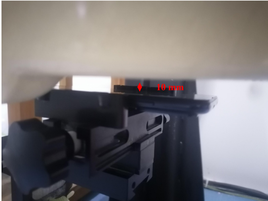
Body (Worn) Back Setup Photo (10mm)