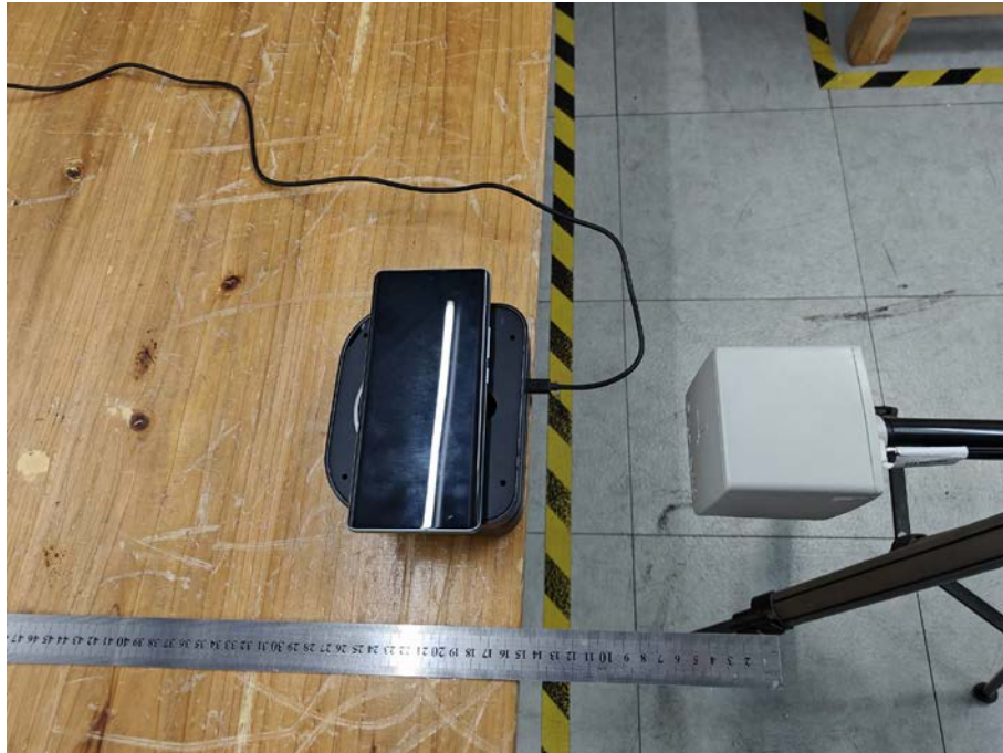
Test Position C-15cm from the edge of EUT to the geometric center of the probe