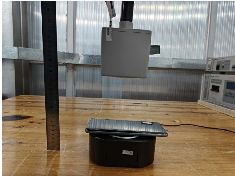
Test Position E-15cm from the edge of EUT to the geometric center of the probe