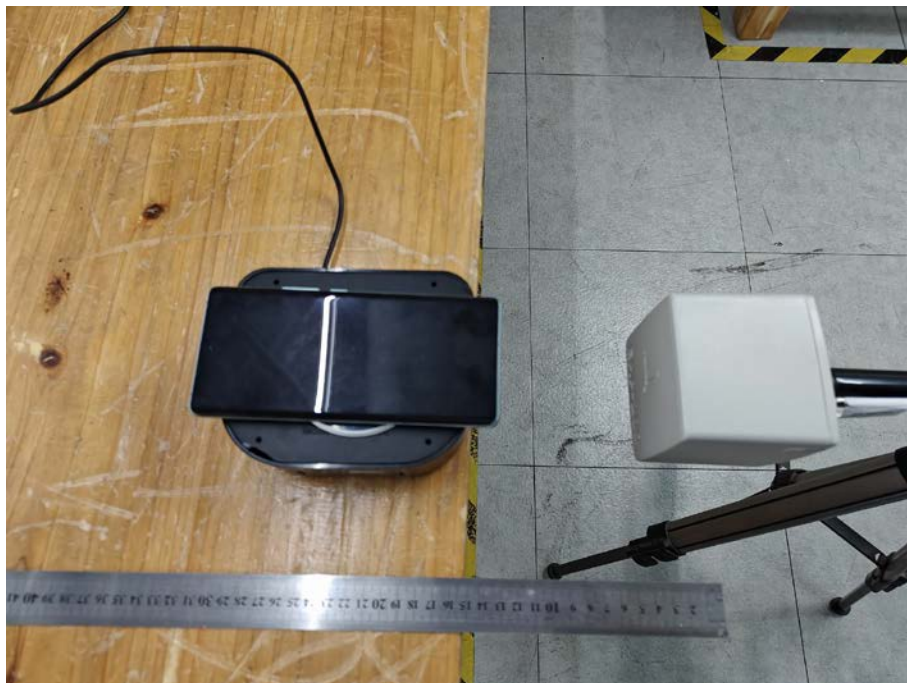
Test Position D-15cm from the edge of EUT to the geometric center of the probe