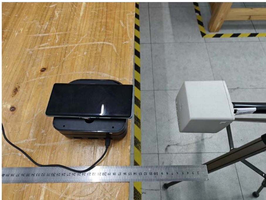
Test Position B-15cm from the edge of EUT to the geometric center of the probe