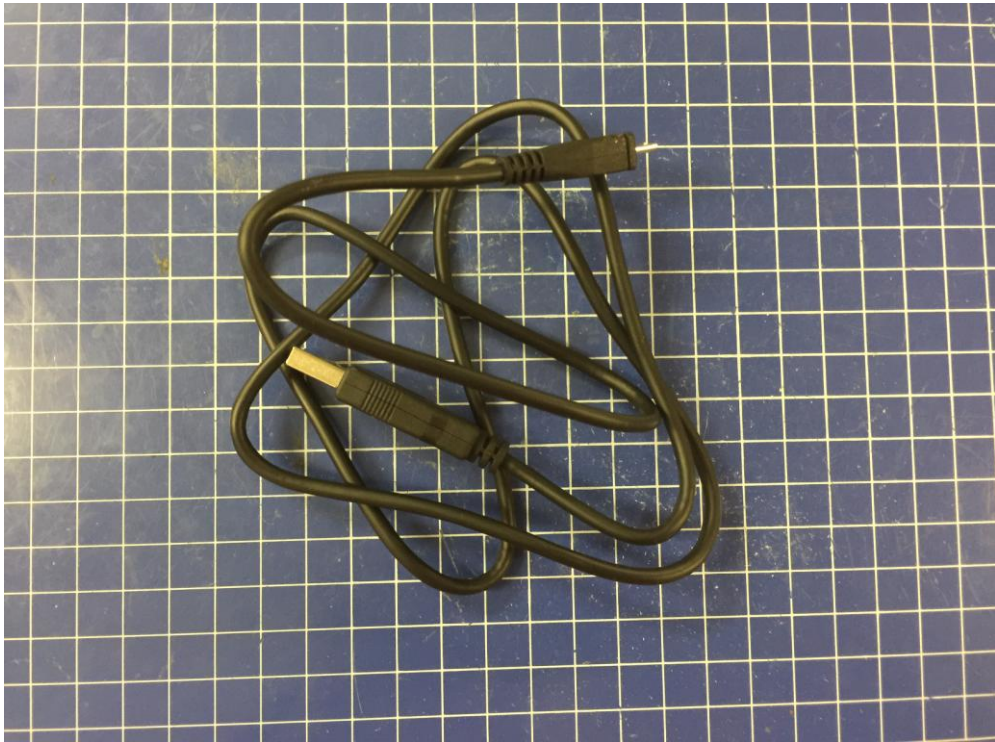
MICRO Black L