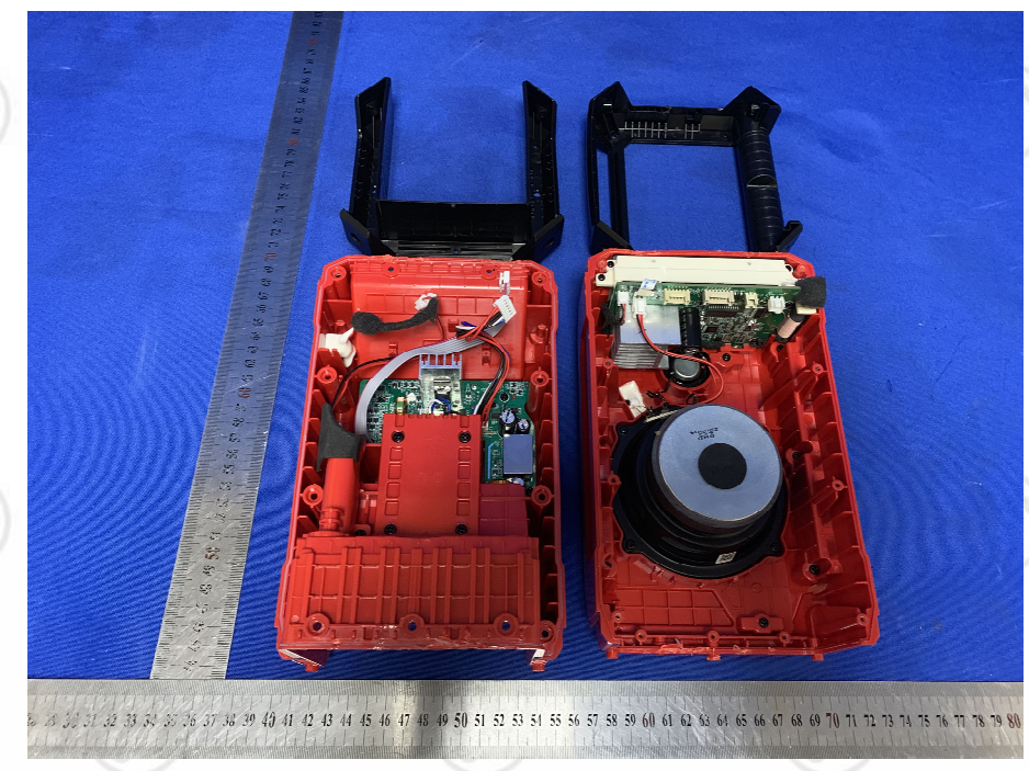
View of Product-13