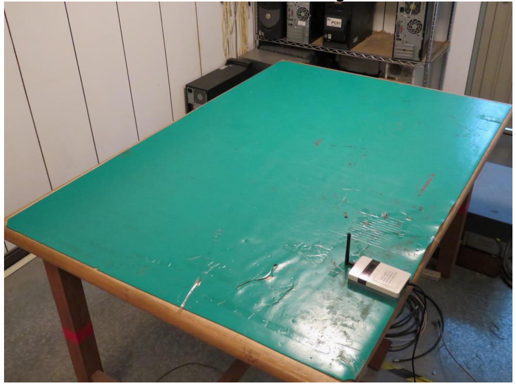
Rear View of The Test Configuration)