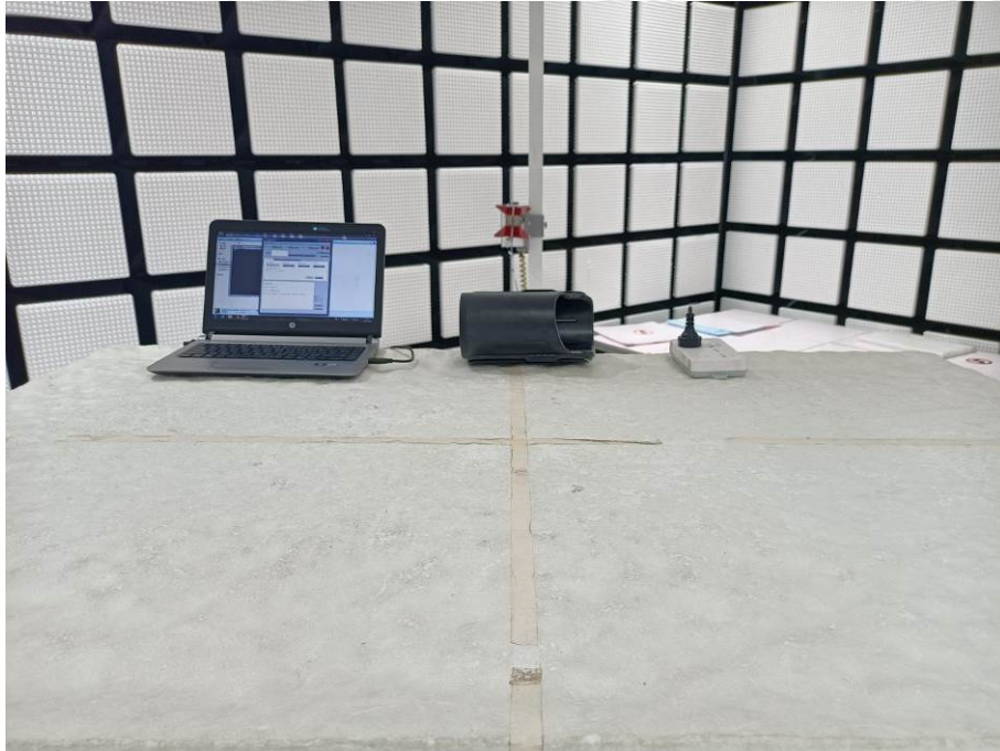
Radiated spurious emission Test Setup-3(Above 1GHz)