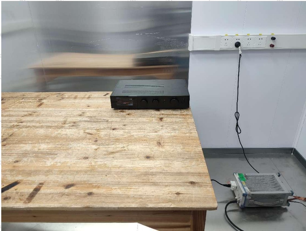
Photo of Radiation Emission Test