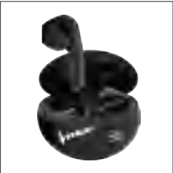
Earbuds Charging Case