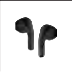
LIVE TWS Earbuds