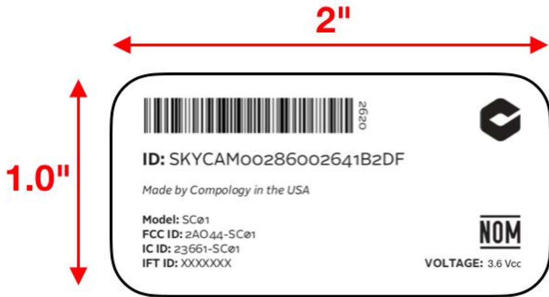
Figure 3. Rendering showing SC01 external label