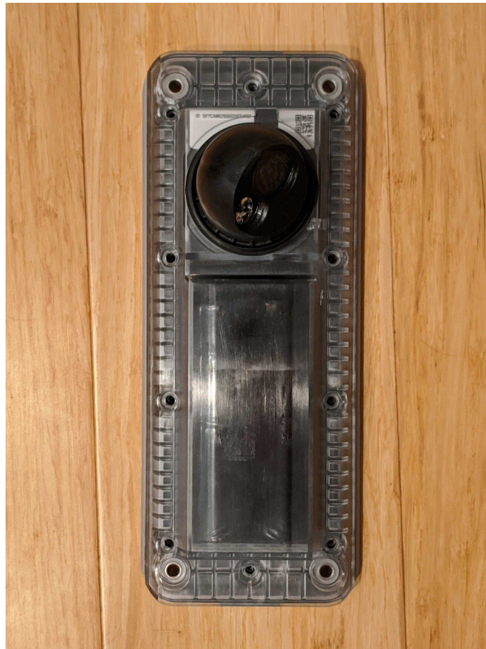
Figure 1. Image showing SC01 front housing with internal label

Below is an image of the SC01 device labels. There are two labels, one containing static information such as model and FCC ID, while the other contains dynamic data, device ID only.