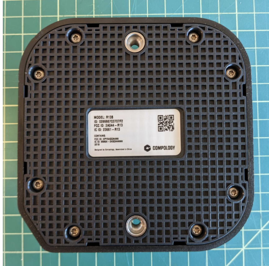
Figure 4. Picture of R13S with label visible on bottom side