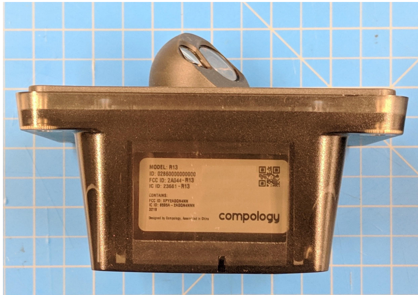
Figure 2. Picture of R13 with label visible on bottom side

The label is placed on the bottom of the device. It is printed on a white label with black text, which provides high contrast against the black plastic.