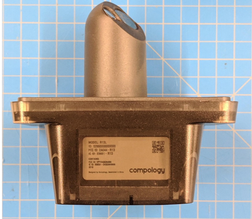
Figure 3. Picture of R13L with label visible on bottom side