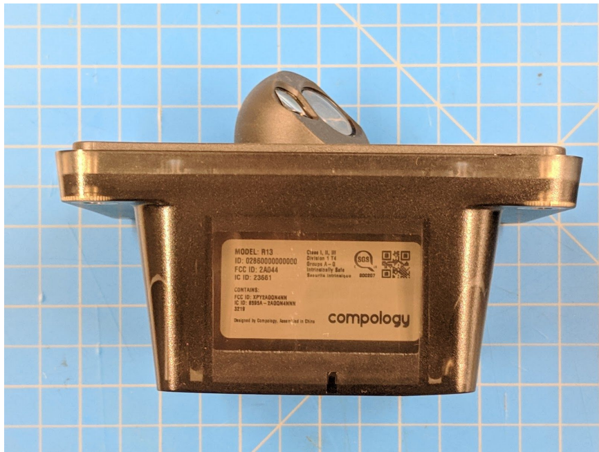
Figure 2. Picture of R13 with label visible on bottom side