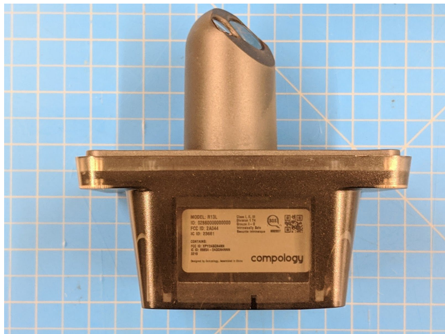
Figure 3. Picture of R13L with label visible on bottom side