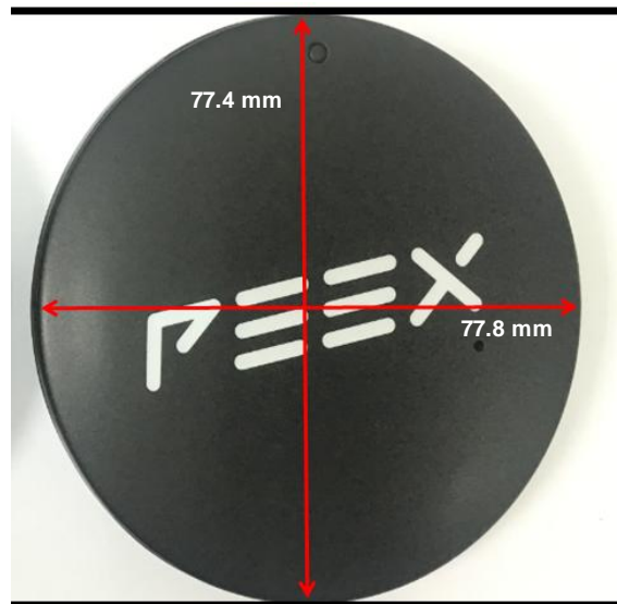
<EUT Front View>

The separation distance for antenna to edge: