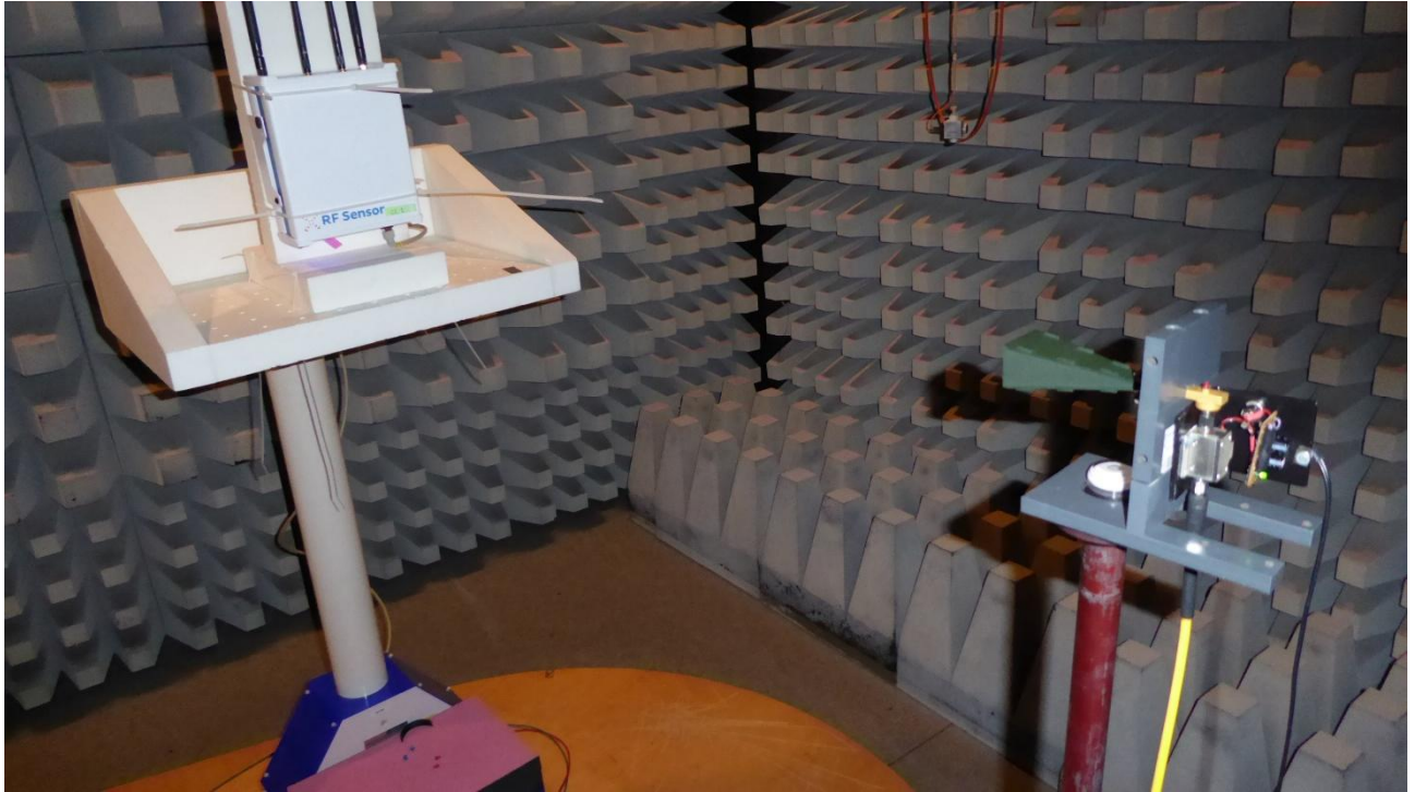
162281_EUT71: Radiated Measurement in the FAR (26 – 40 GHz)