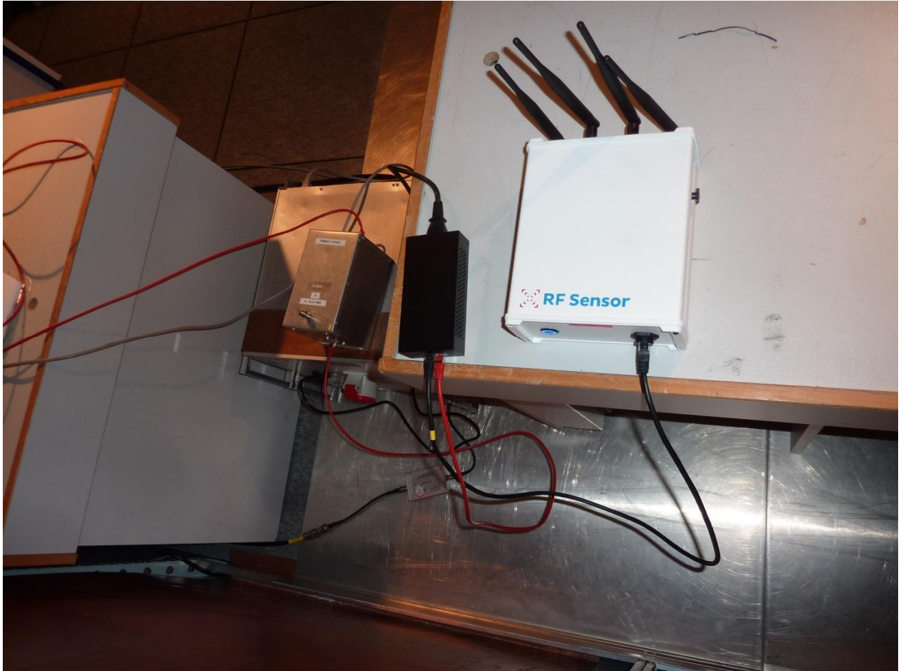
162281_EUT59.: Conducted emissions measurement