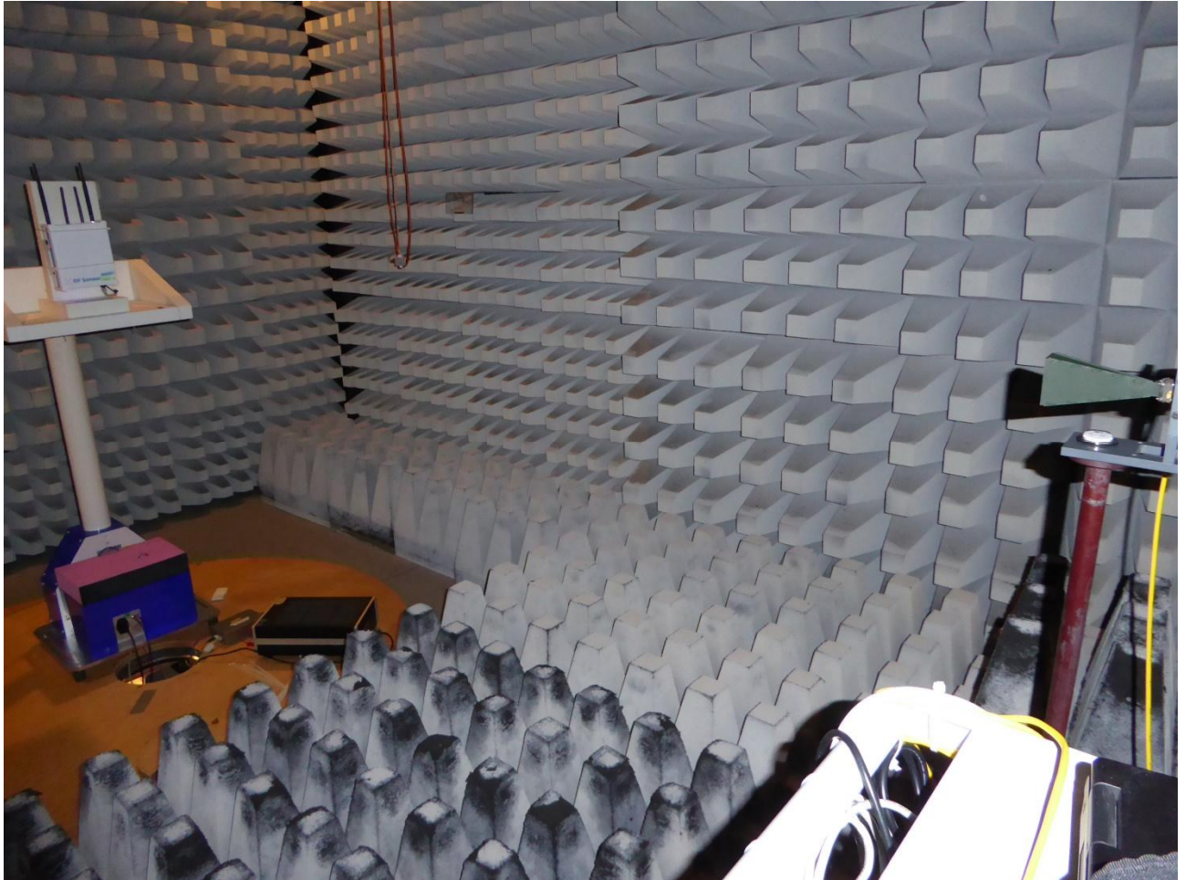
162281_ EUT49: Radiated Measurement in the FAR (18 – 26 GHz)