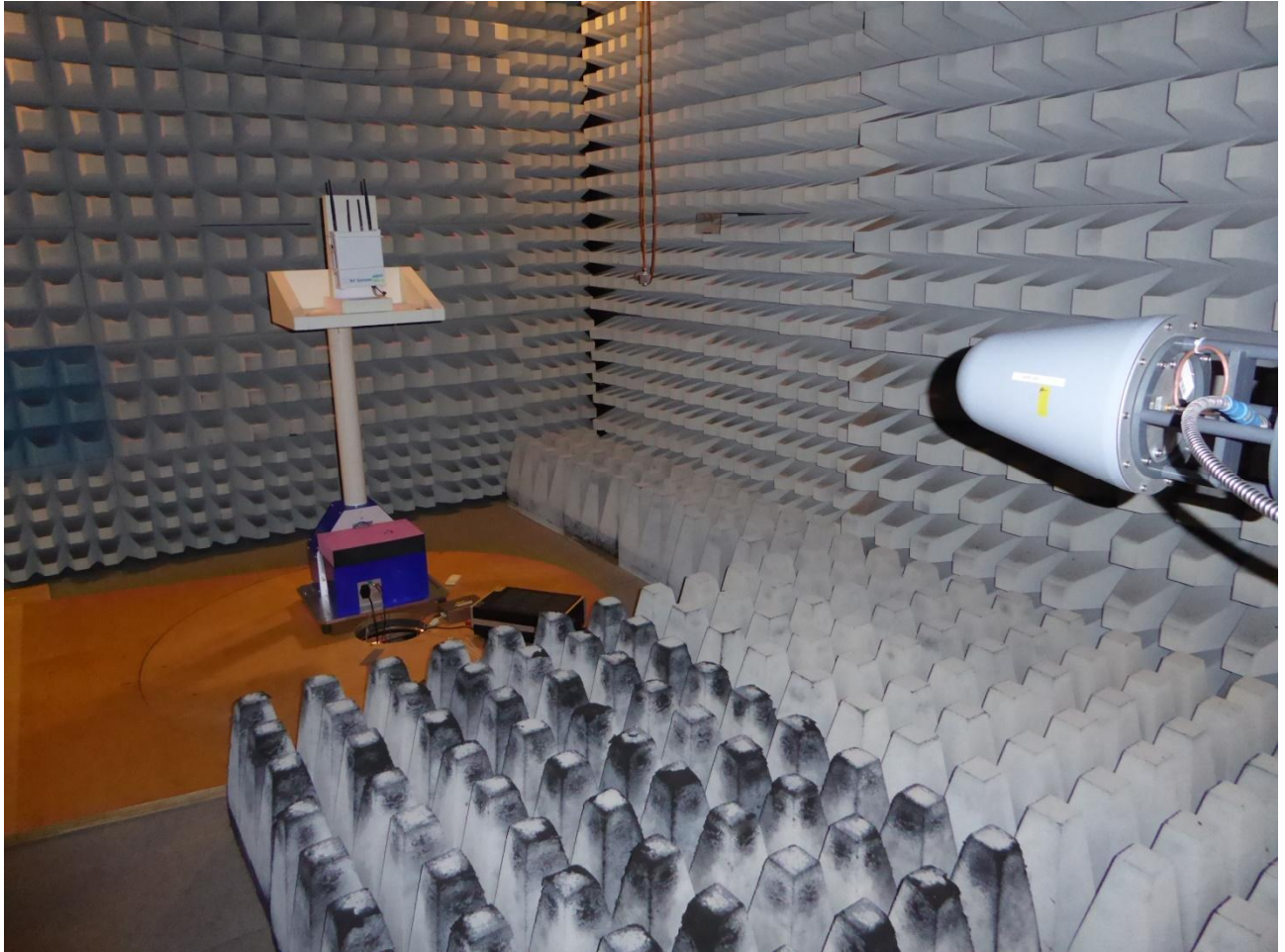
162281_EUT37: Radiated Measurement in the FAR (1 - 12 GHz)