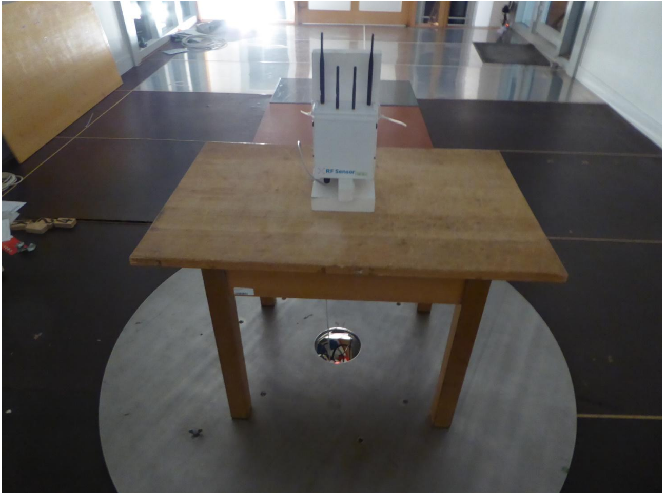
162281_ EUT80: Radiated Measurement OATS (30 MHz - 1 GHz)