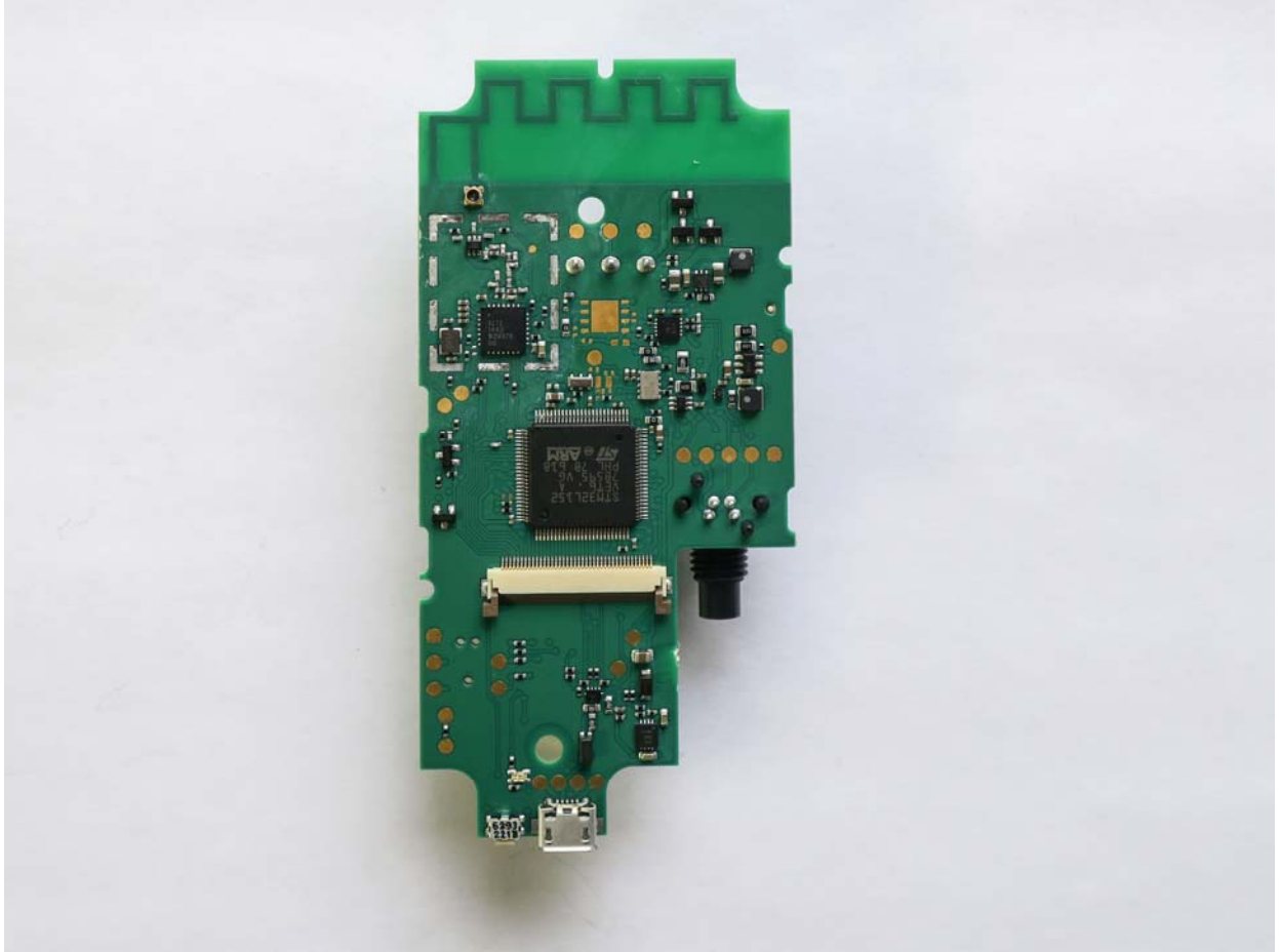
RFL100 PCB front radio module shield off