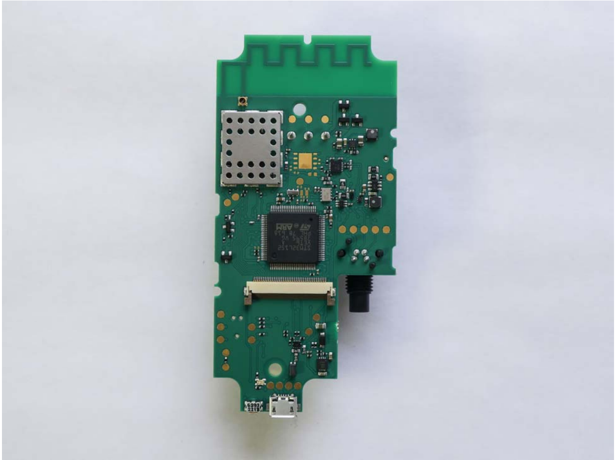
RFL100 PCB front