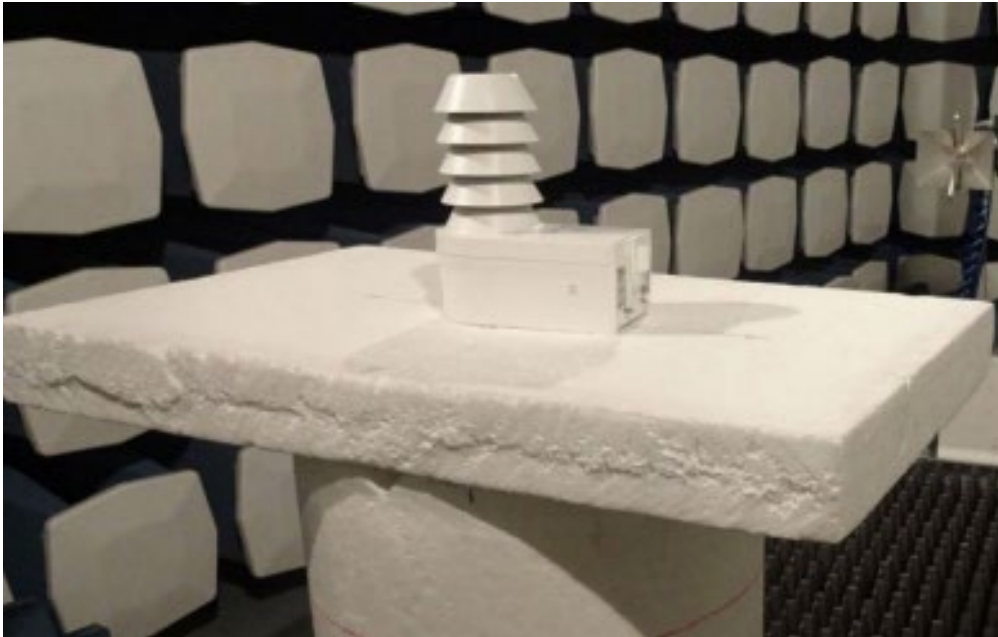
Radiated emission, 1-12,75 MHz

Test Report number: 3772RER005A2 FCC part 15C Bluetooth 5.2