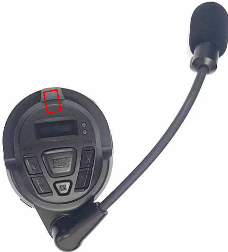
Figure F-1 Antenna Location