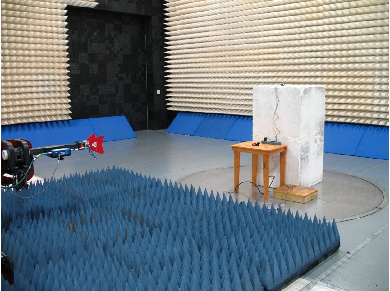
Radiated Emissions, 1GHz-18GHz (transmitting)